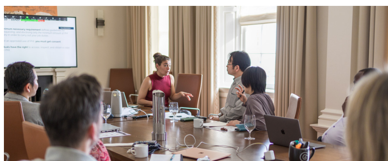
Halcyon: a DC-based residential incubator for social entrepreneurs | Phoenixi Fellows attended a Skill Series, pitch session, partner mixer, etc during the tour.