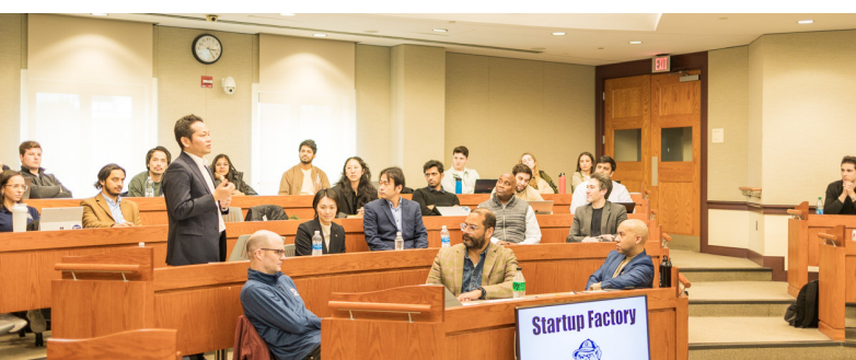
Georgetown MBA Startup Factory final pitches | Also visited Georgetown Venture Lab; White House Presidential Innovation Fellows; Deloitte, etc on the tour.

Halcyon+DC Tour for Phoenixi Fellows to take a glimpse into the US Capital startup ecosystem | 3 alumni visited 8 organizations driving impact businesses; and attended 12 events over the course of 5 days (March 2024).