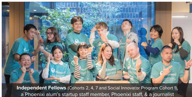
Independent Fellows (Cohorts 2, 4, 7 and Social Innovator Program Cohort 1), a Phoenixi alum's startup staff member, Phoenixi staff, & a journalist