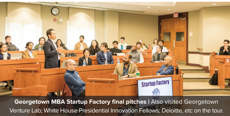
Georgetown MBA Startup Factory final pitches | Also visited Georgetown Venture Lab; White House Presidential Innovation Fellows; Deloitte, etc on the tour.

Halcyon+DC Tour for Phoenixi Fellows to take a glimpse into the US Capital startup ecosystem | 3 alumni visited 8 organizations driving impact businesses and attended 12 events over the course of 5 days (March 2024).