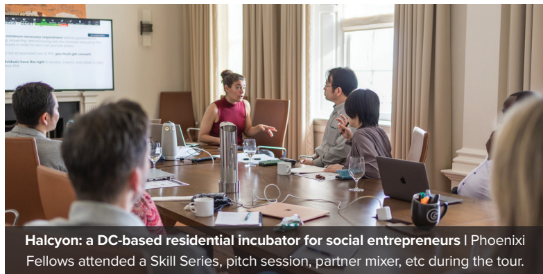
Halcyon: a DC-based residential incubator for social entrepreneurs | Phoenixi Fellows attended a Skill Series, pitch session, partner mixer, etc during the tour.

Interviews with Independent Fellows [Eng, Jpn]