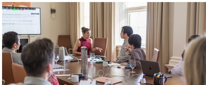
Halcyon: a DC-based residential incubator for social entrepreneurs | Phoenixi Fellows attended a Skill Series, pitch session, partner mixer, etc during the tour.