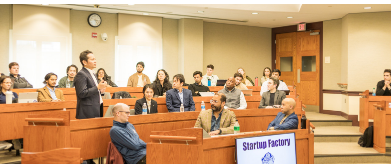
Georgetown MBA Startup Factory final pitches: Also visited Georgetown Venture Lab; Presidential Innovation Fellows; Deloitte, etc on the tour.

Halcyon+DC Tour for Phoenixi Fellows to take a glimpse into the US Capital startup ecosystem | 3 alumni visited 8 organizations driving impact businesses; and attended 12 events over the course of 5 days (March 2024).