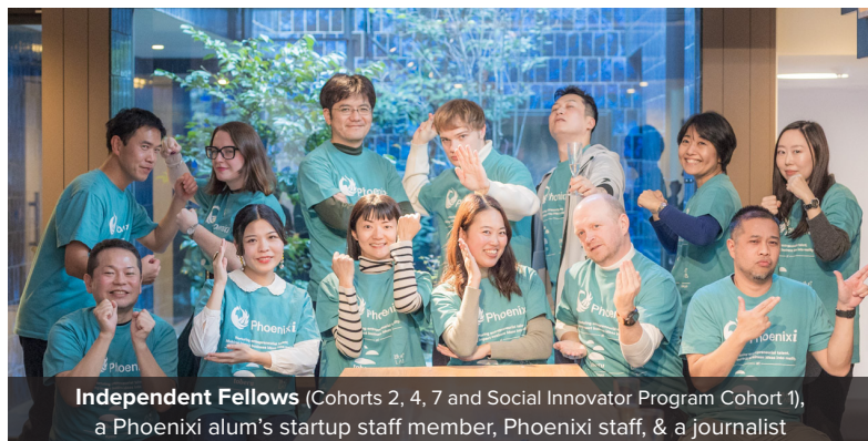
Independent Fellows (Cohorts 2, 4, 7 and Social Innovator Program Cohort 1), a Phoenixi alum's startup staff member, Phoenixi staff, & a journalist