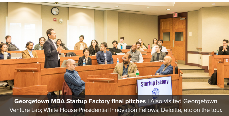
Georgetown MBA Startup Factory final pitches | Also visited Georgetown Venture Lab; White House Presidential Innovation Fellows; Deloitte, etc on the tour.

Halcyon+DC Tour for Phoenixi Fellows to take a glimpse into the US Capital startup ecosystem | 3 alumni visited 8 organizations driving impact businesses and attended 12 events over the course of 5 days (March 2024).