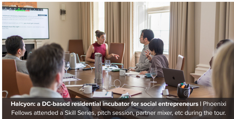
Halcyon: a DC-based residential incubator for social entrepreneurs | Phoenixi Fellows attended a Skill Series, pitch session, partner mixer, etc during the tour.

Interviews with Independent Fellows [Eng, Jpn]